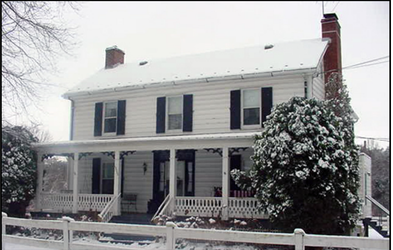
Photo above by M. Breeden, January 19, 2002 Two photos below taken by Nancy Born, July 1989 for the National Register of Historic Places, File #76-338